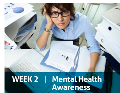
WEEK 2 | Mental Health Awareness