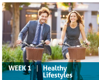
WEEK 1 | Healthy Lifestyles

In our quest to help you keep moving forward and improve your life, Homewood Health delivers an array of ready to use, easy to access services that will help steady yourself and find a path in life that feels comfortable and safe.