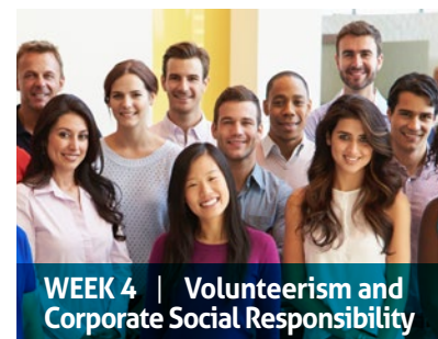
WEEK 4 | Volunteerism and Corporate Social Responsibility