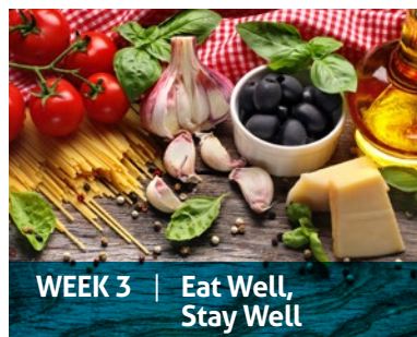
WEEK 3 | Eat Well, Stay Well